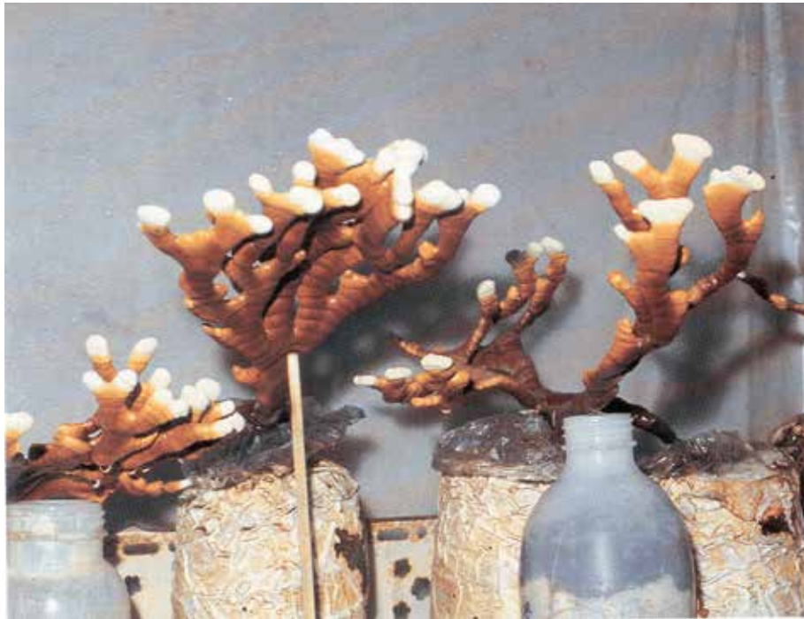
Fig. 1e G. lucidum growing on sterilised sawdust media (Willard, 1990)